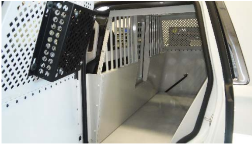
2018 CHEVY TAHOE AMERICAN ALUMINUM K9 INSERT CAGE WITH DOOR POPPER AND SIDE WINDOW FAN. REMOVED ALL FACTORY SEATS FROM ORIGINAL TAHOE AND BUILD K9 INSERT INSIDE REAR OF SUV.

ACE K9 NO K9 LEFT BEHIND KIT AND MODULES WITH SEPARATE FUSE BLOCK. THIS ALLOWS A PAGING SYSTEM TO ACTIVATE IF K9 IS LEFT IN THE CAGE AND HEAT SENSORS REACH A CERTAIN TEMPERATURE. THE WINDOWS WILL AUTOMATICALLY DROP AND FAN IS ENGAGED HORN WILL HONK AND LIGHTS WILL FLASH DUE TO K9 LEFT IN HOT INTERIOR.