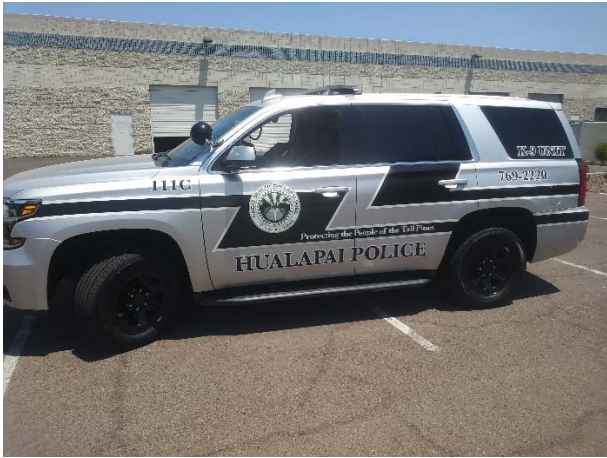
2019 CHEVY TAHOE AMERICAN ALUMINUM K9 INSERT CAGE WITH DOOR POPPER AND SIDE WINDOW FAN. REMOVED ALL FACTORY SEATS FROM ORIGINAL TAHOE AND BUILD K9 INSERT INSIDE REAR OF SUV.

FINISHED FORD UTILITY POLICE INTERCEPTOR 2018 WITH RED AND BLUE BASIC LIGHTING, SETINA PUSH BUMPER, N FORCE LIGHTBAR, SOUNDOFF SIGNAL LIGHTS ALL AROUND. WE HAVE DONE BLUEPRINT BUILDS THOSE REQUIRE MORE TIME AND MORE DETAIL FOR BUILDS AND PROGRAMMING.