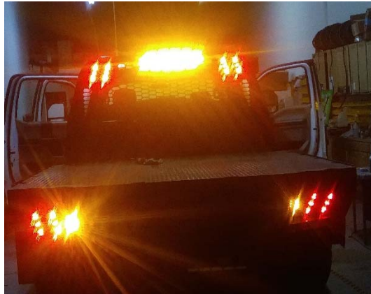
2018 FORD F250 FLAT BED WITH AMBER LIGHTING, ARROW STICK AND FLASHERS. COMPLETED ENTIRE URBAN SITE SERVICES, ENTIRE FLEET.

TROY COMPLETED CONSOLE WITH BASIC 2 WAY RADIO, SOUNDOFF SIREN CONTROLLER WITH PA, FACTORY USB, 12 VOLT OUTLET, CUP HOLDER BASIC SETUP. THIS IS MOST STANDARD SETUP FOR AND POLICE BUILDS.